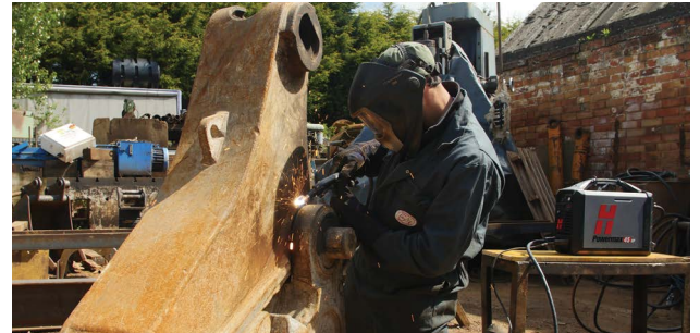
Maintenance and repair